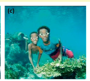
TRENDS in Ecology & Evolution