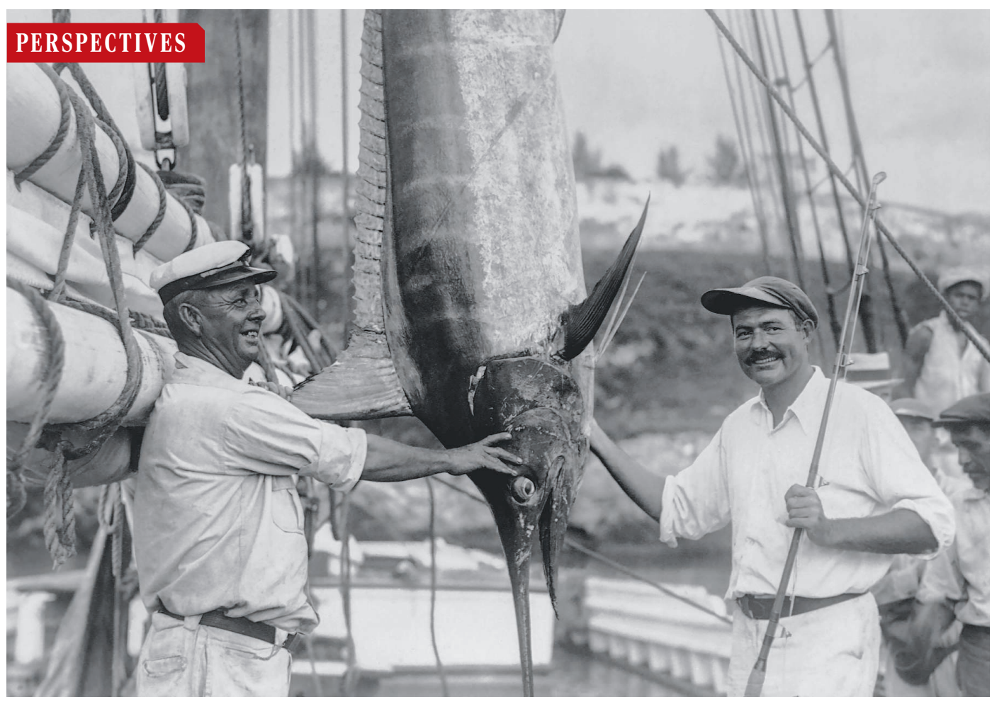
Unnatural selection. Human hunters and fishers (such as Ernest Hemingway, pictured with a marlin) specialize in adult prey and often target large, healthy individuals.