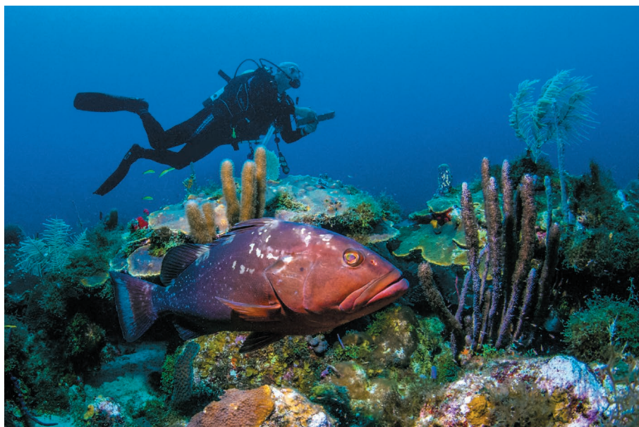
Figure 1 | A diver monitors marine life at the Dry Tortugas Ecological Reserve in Florida. Gill et al. 7 report that the biggest factors in the success of marine protected areas are adequate staffing and funding.